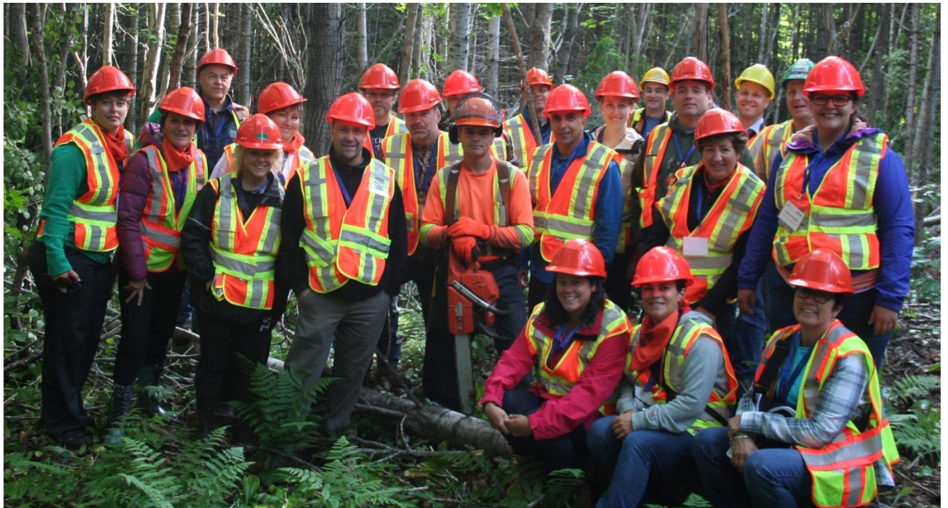
Photos from the 2016 Teachers tour