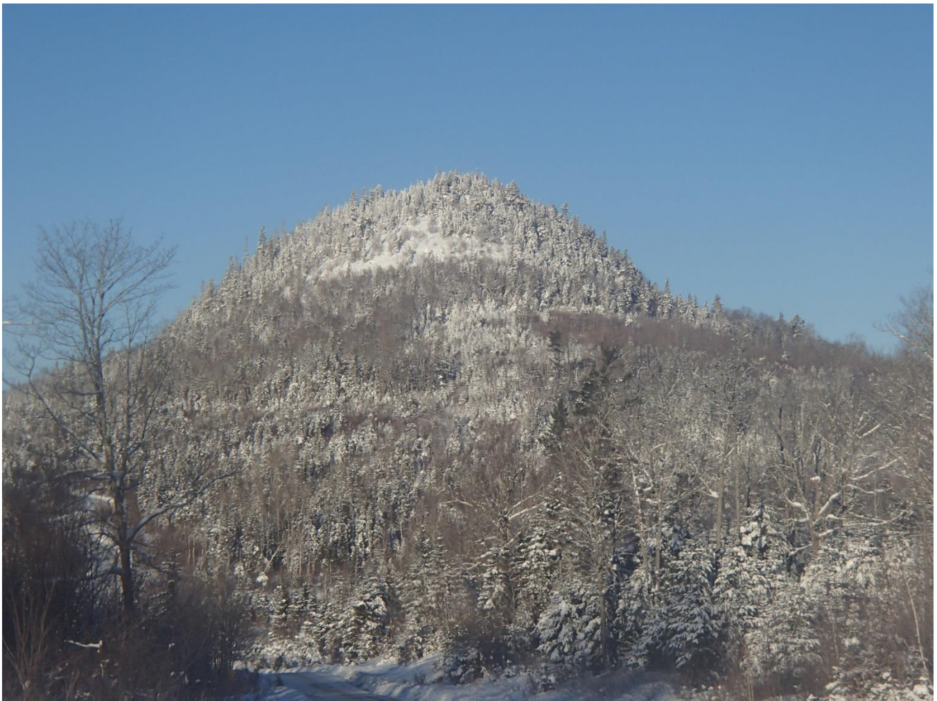
Winter has settled in across the New Brunswick landscape.