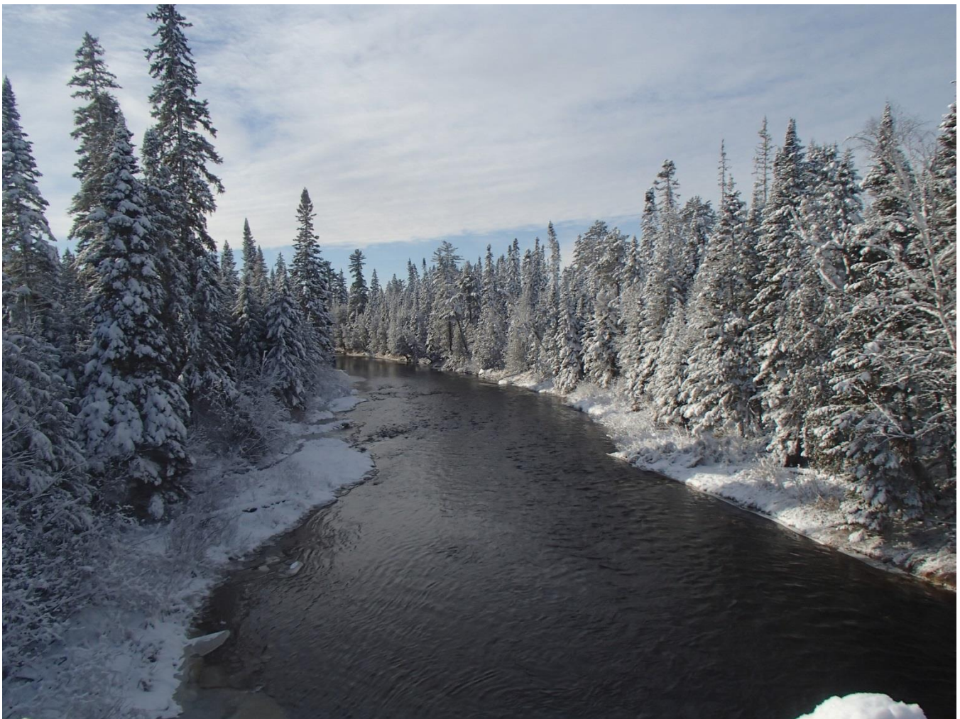
Wapske River in NW NB, December 2015